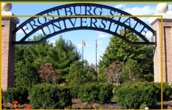
Frostburg State University