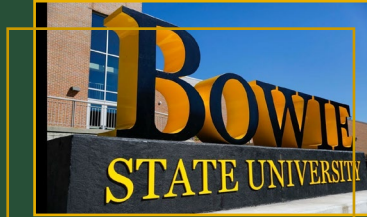
Bowie State University