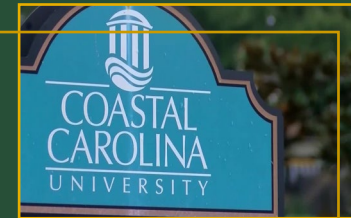
Coastal Carolina University