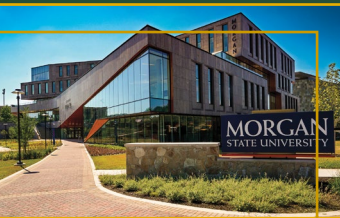
Morgan State University