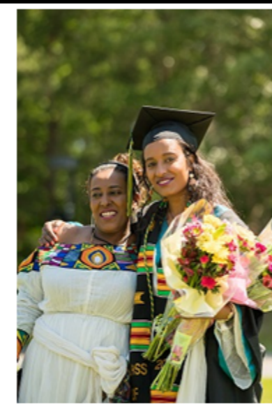
Meet the Spring 2021 Grads Watch the ceremony, see grad photos and meet with us at: