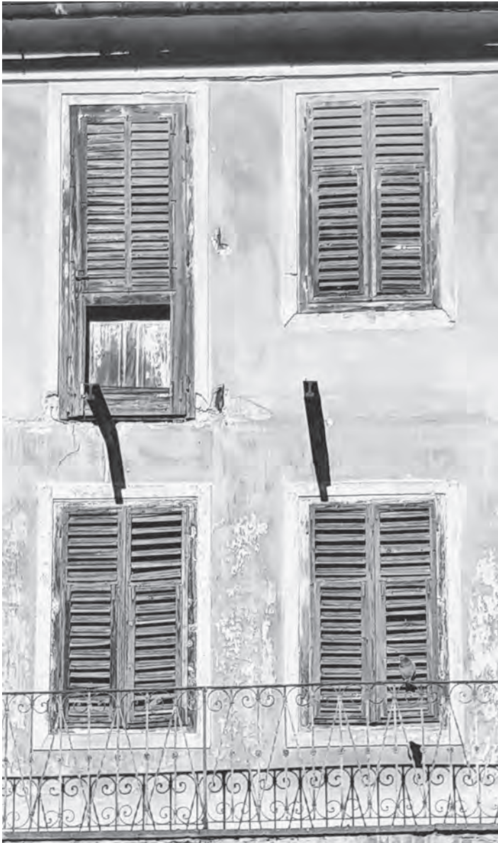
Siesta in Brixen, Italy, Mona Weber