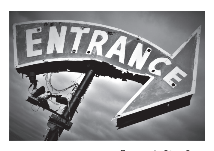
Entrance, by Diane Payne