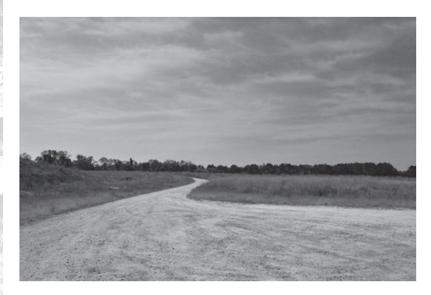
The Less Traveled Road by Mary Prather