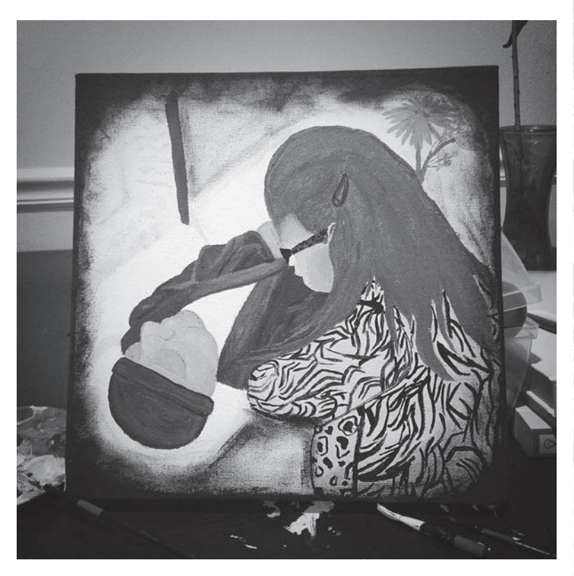
Untitled by Liliana Zumbrun