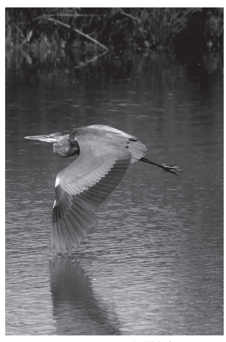
In Flight by Diane Payne