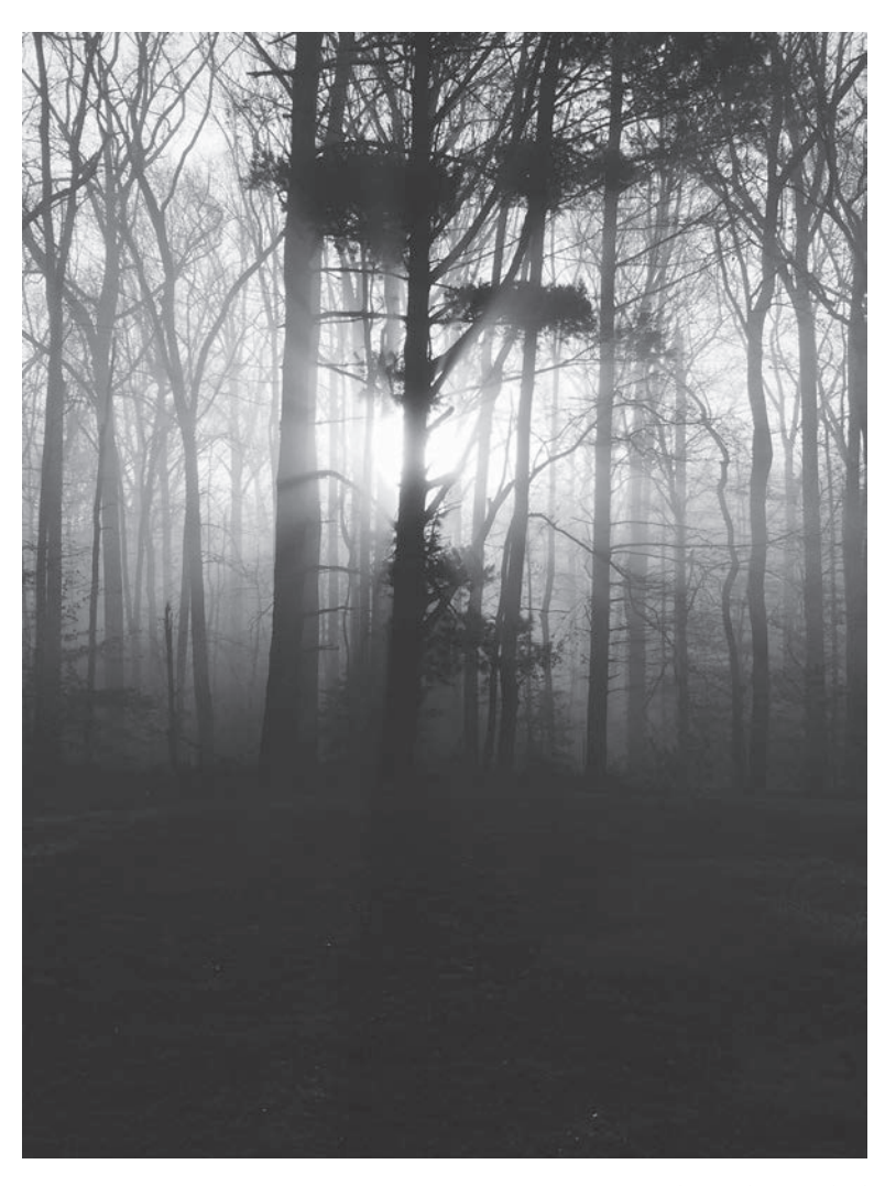
December Light by Eileen Abel