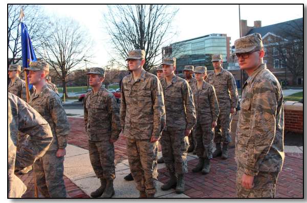
#1 Large Detachment in the North East Region in 2016

All cadets are required to attend Field Training, a 13-day summer course, usually completed between sophomore and junior year. Field Training is a physically and mentally challenging series of group projects, fitness activities, and leadership exercises.