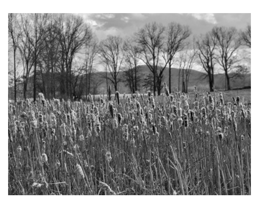
Fields in the Berkshires, Mona Weber